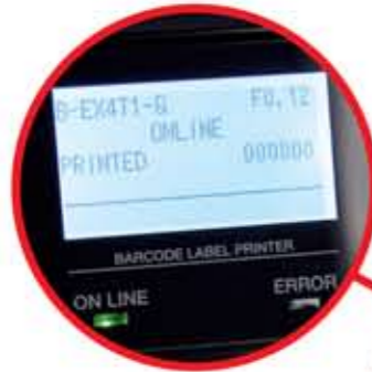
User-friendly front panel for easy operation and status reporting with helpdesk

Reliability and performance usually come at a cost but, with the B-EX series, premium capabilities come as standard, essentially lowering initial capital outlay and future-proofing your investment.