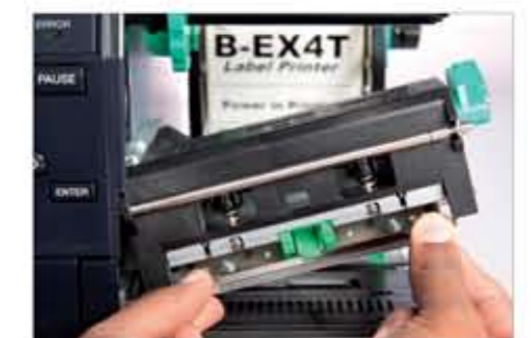
Snap-in printhead reduces maintenance downtime to a minimum

The unique intuitive graphical LCD 'helpdesk' display improves usability and prompts even the novice user to take immediate corrective action where necessary, keeping user training to a minimum.